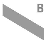
B 5 × 23 cm 2" × 9"