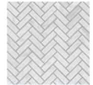
Bianchi Venato Mosaïque