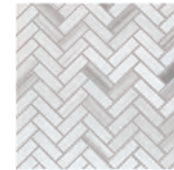
Bianchi Striato Mosaïque